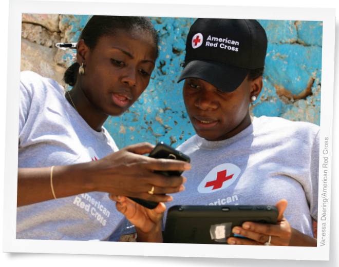
The American Red Cross continues to broaden its use of technology in Haiti, using tools such as GPS-enabled smartphones to collect and analyze information.

The American Red Cross would like to thank the many individuals, corporations, foundations and government agencies that so generously support our work in Haiti. Your contributions are making a difference in the lives of almost 4.4 million people in Haiti that we have reached since the earthquake. We are committed to spending your donations wisely to help the Haitian people recover, rebuild and be better prepared for the future.