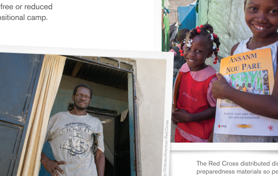
The Red Cross distributed disaster preparedness materials so people will be better prepared for the next emergency.

This program not only helps individuals recover from the earthquake, but will also provide longer-term financial support into the future and help build a community's resilience. Through the distribution of cash grants, loans and other credit, as well as vocational training and short-term employment opportunities, the American Red Cross has offered critical assistance to almost 383,000 Haitians working to provide for themselves and their families. Moving forward, the focus of our work is shifting toward longer-term projects that build skills, promote the growth of small businesses and ultimately lead to further job creation.